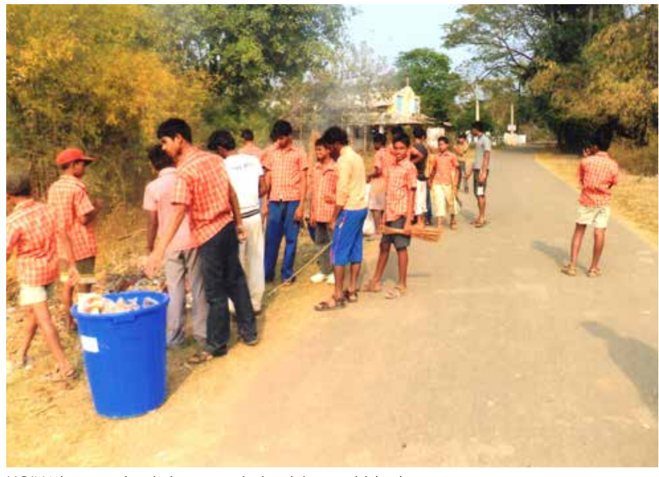
HOINA boys serving their community by doing roadside cleanup.

When Indians were under the rule of the British, they were as the slave of India. At that time Gandhi raise the Indians with the slogan, "Do or die." It means all Indians rise up against the British to come from the Indian slavery. India has 28 states. Among those 28, Andhra Pradesh (A.P.) is one of the beautiful place. Among A.P.'s 23 districts, Visakhapatnam is one of the famous city. Visakhapatam called as harbor ship. In Visakhapatnam, Kothavalasa Mandal, in Sunkarpalem Village there is huge, peaceful, beautiful, and clean home. This is called HOINA. In that home there is so many orphan children. They live happy and studying well, and get good marks, good name from school, college. They don't worry about their future because HOINA