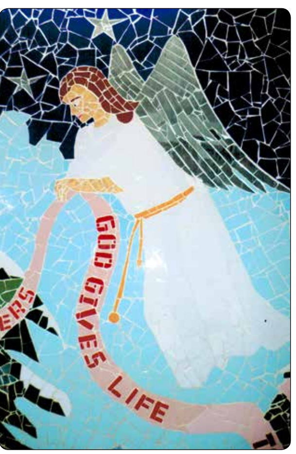
One of the tile murals that flank the entry of our new chapel.

On our campus we have a little 3-foot-wide trickle that we call a canal. After a day or two of heavy rain, it became a raging 50-foot wide river and was 12 feet deep in some places. Our road that passes our cows and their shed and that leads back to the boys' home was washed