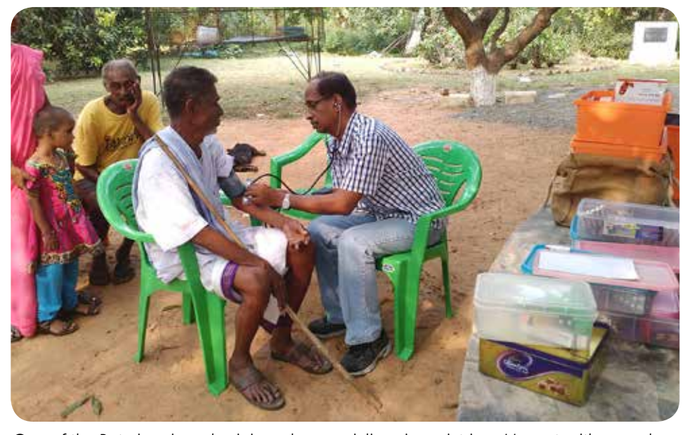
One of the Rotarians is a physician who specializes in geriatrics. He met with a number of elderly people from our community and provided medicine as needed.

unhurriedly they brought dish after dish—filling and refilling bowls, plates, and glasses. They were calm, poised, and magnificent. I looked on as a proud parent might look at his child's successes. Their mature accomplishment that day will be one of the memories that I will recall when I am home and think yearningly of HOINA.