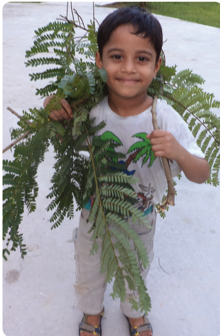
Even our littlest helpers lend a hand on the HOINA campus.

Without looking at me he gestured to include it all, the children on the playgrounds, the buildings and the trees and flowering shrubs, and said, "This makes my heart feel happy." Most people who come to HOINA experience