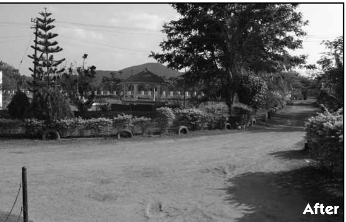
Photos of the driveway at the girls' home from six years ago and present day. Use the evergreen on the left side of the photo as a comparison.