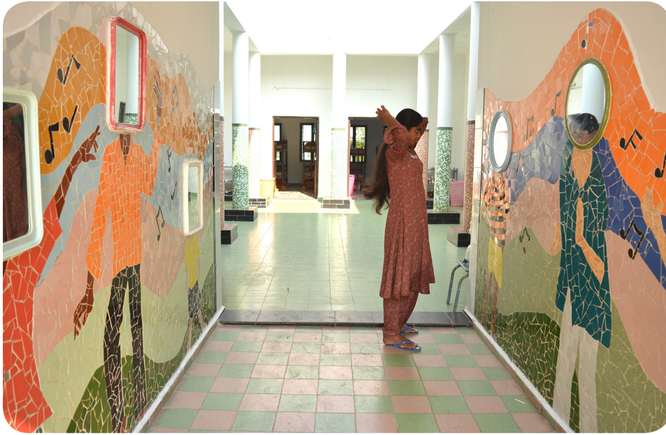
The hallway off the restroom block where mirrors greet students preparing for their day.

Mom recalls that one year she went to see the Republic Day celebrations in Delhi where she was so excited to be sitting not far from the Prime Minister Rajiv Gandhi who was her hero. It was this experience that was