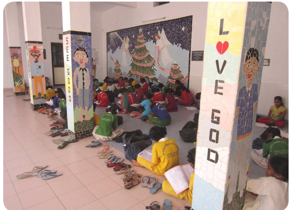
The HOINA girls diligently studying in our courtyard, surrounded by colorful murals.