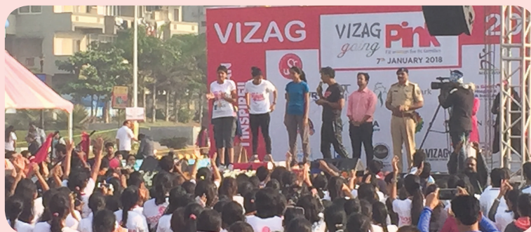
Top: HOINA girls and York College students gather before the Pink Run event.