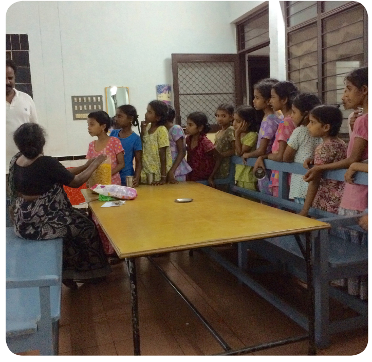
Girls waiting patiently for treats.

sorts of colored threads and even found embroidery hoops. Shopping in India can be daunting, but I never met anyone with more perseverance than Darlene. The embroidery assignment was to take pillow covers (pillowcases) and draw the girl's name and a flowery design. The place was abuzz with girls walking around with their projects, finding a cool place perhaps to work under the mango grove. It really brought out their creativity, and everyone had fun.