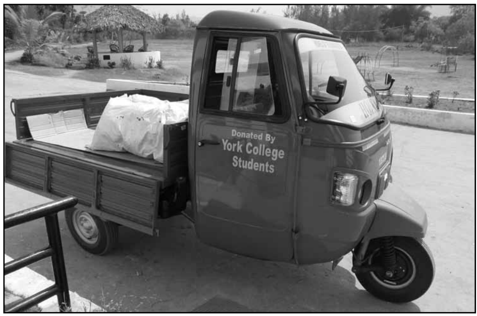
The York students blessed us with a gift with which we were able to purchase an auto-rickshaw for hauling supplies. Its gas mileage will surely be a blessing as it gets 30 km. per liter of fuel.

I think we may have to call 2012 "Our Year for Vehicles." As you can see in the photo above, we have a new utility rickshaw thanks to this year's York College students' generosity. Our Jeep that we used for shopping, transporting children to the hospital, picking up visitors at the airport, and other general running was dying. Late in 2011 God