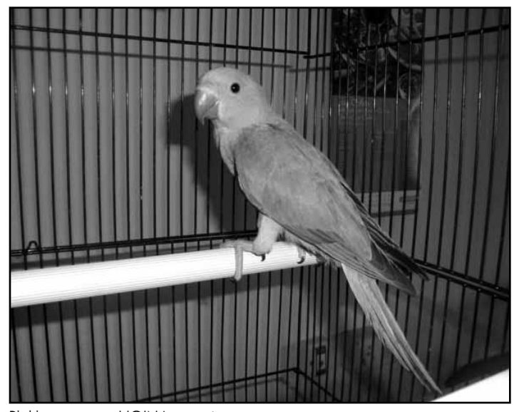
Pinkie, our new HOINA parrot

children love sitting on the benches and watching the ducks swim around. We have 11 of them now. Our seven cows from last year are now fifteen; three are carrying calves. Our monkey seems to be happy in his large cage. When two baby parrots fell out of a tree that was being cut down, we fed them cut-up worms and added cow's milk and the yolk of the hard-cooked egg to make a "delicious" soupy paste that they eat from a spoon. After a while bananas, papayas, and tomatoes took a back seat to our worm "stew." Our children learn so many things by being surrounded by nature and God's creatures. We are grateful to all of our donors who help make this work possible.