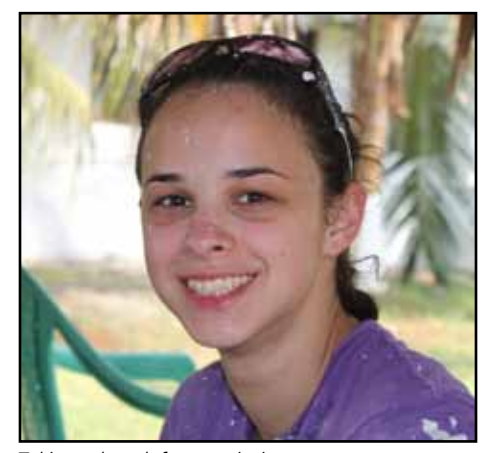
Taking a break from painting.

After the children had cake, they went back to the girls' and boys' homes, where they each opened their gifts. The smiles on their faces said it all. It did not matter what they got in those boxes; they were just happy to have something to open.