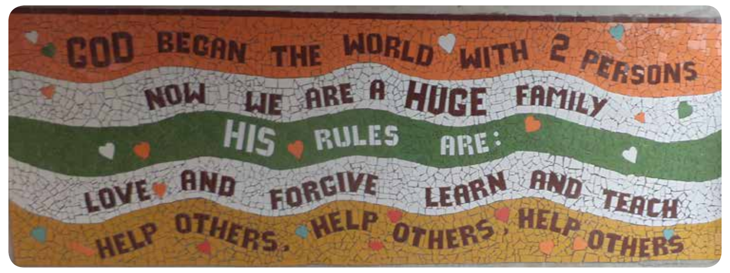
Help Others: As promised last month, here is a photo of the finished mural that our girls built for our HOINA home. Our campus is decorated with mosaics in many buildings. Their encouraging messages add color and beauty to our campus. We are grateful that Cyclone Hud Hud didn't destroy any of these original artworks when it hit our campus last year.