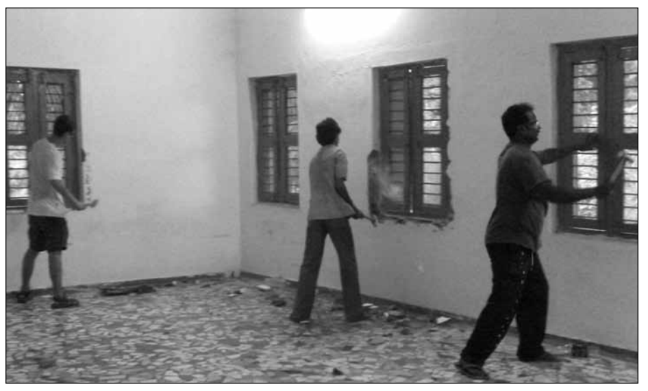
Working together to extract the windows