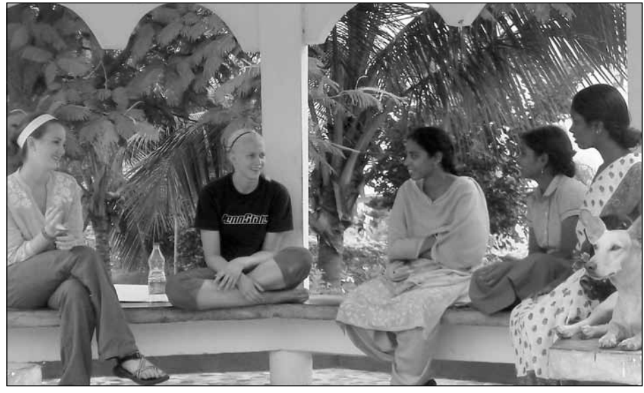
PSU students teaching English to some of the HOINA girls