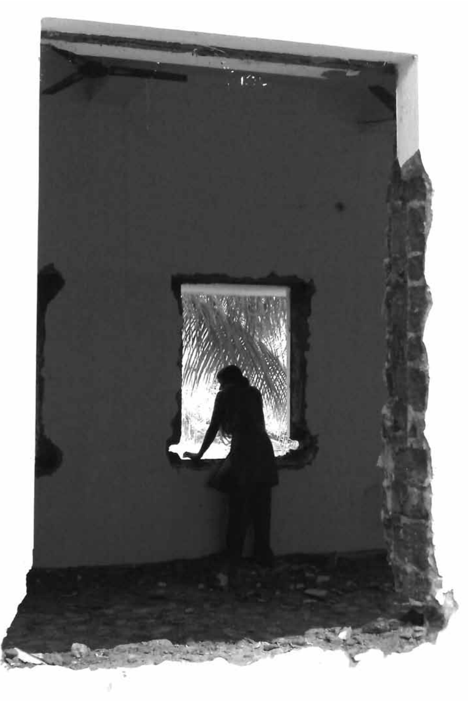
Awaiting the replacement windows.

PO Box 87, St. Charles, Missouri 63302 • www.hoina.org • September 2010