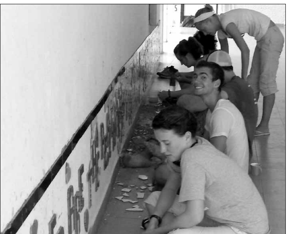
PSU Students work on the tile mosaic

I love this group and the HOINA girls love this group. I will never forget them!