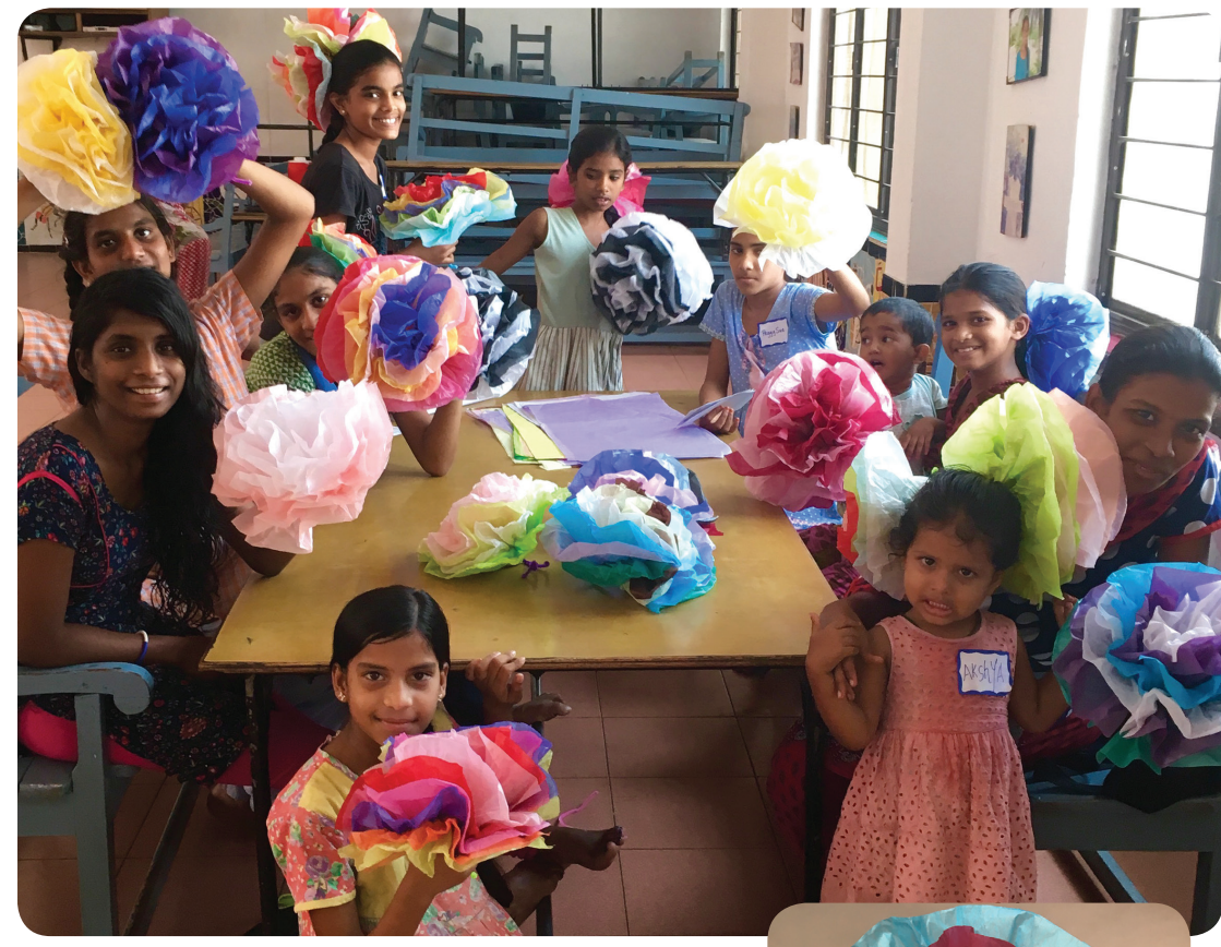
The girls had much fun making paper flowers!

While the site of HOINA is familiar to me, this year's visit was different. The fact was that very few children were on campus. You see, the month of May in India is summer vacation from school. Although HOINA has many orphans or "semiorphans," most of them have some relations whom they visit during their school break. Much to my surprise I was greeted by only 20 girls and 10 boys! In one way, this fact made my life much easier—fewer