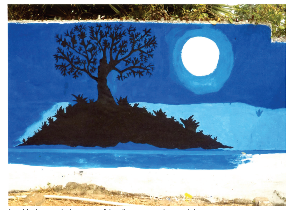
Our older boys worked on many of the silhouette murals around the campus.