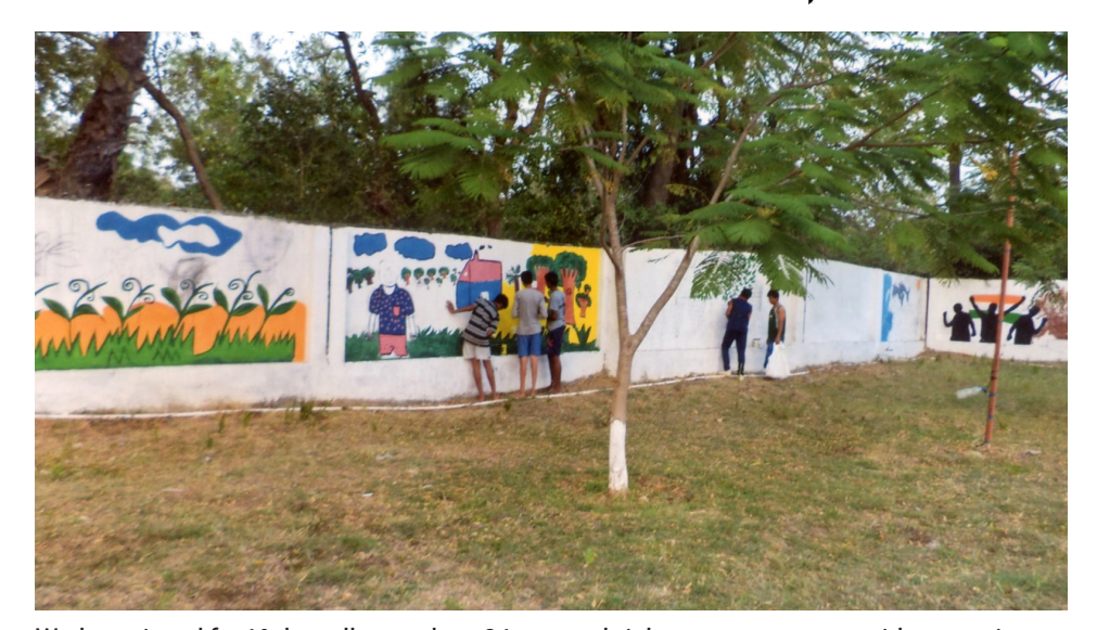
Work continued for 10 days all around our 24 acres to brighten up our campus with expressions of creativity.

The official registration and financial information of Homes of the Indian Nation (HOINA) may be obtained from the Pennsylvania Department of State by calling, 1.717.787.1057. Registration does not imply endorsement.