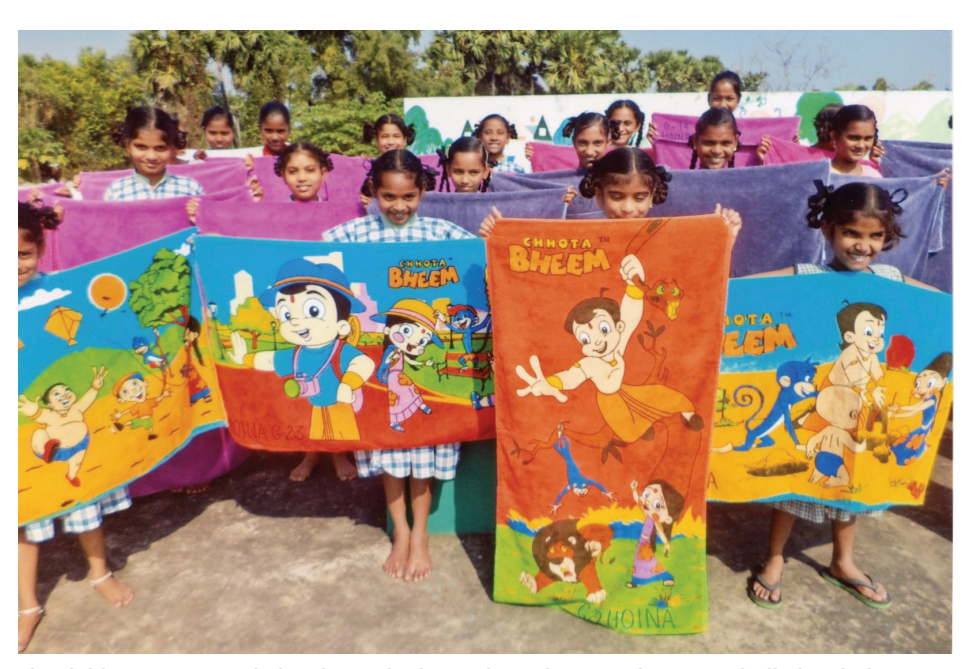
The children were provided with new bath towels on this trip. They were thrilled with the colorful choices.

On my most recent trips to India, word "got around" that I had arrived. A good number of our graduates whom we call HOINA Tigers called me, visited me, telephoned me, and emailed me. They brought me up to date on where they are now and what they are doing. They