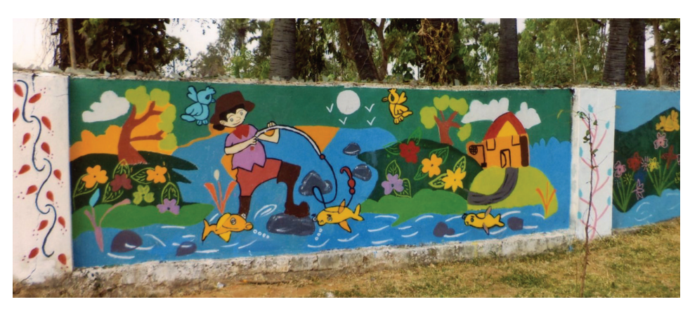
Our younger students had fun displaying their talents as well, even if they were not grand prize winners.