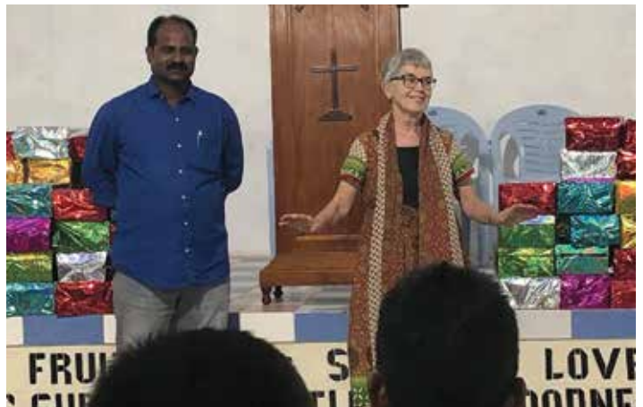
Top to bottom: