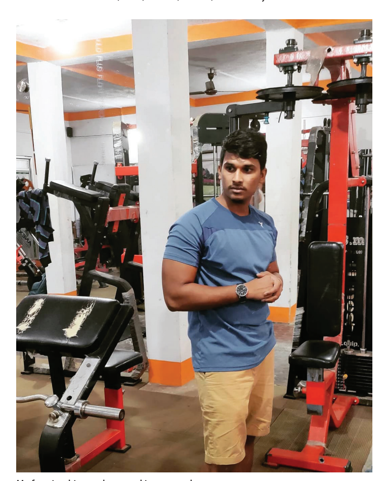
My favorite thing to do—working out at the gym.

offer me any help or plans for my future.