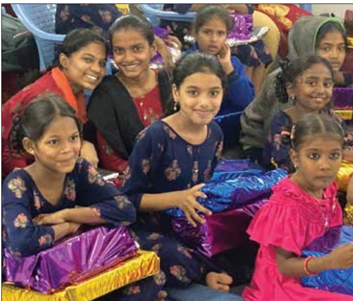
HOINA girls are excited to be opening their gifts.

The gifts, wrapped in brightly colored foil wrapping paper, were sitting on the stage when the children arrived, and you could see the excitement in their eyes as they waited patiently to receive their gift. Staff members read off the kids' names one by one as everyone clapped and cheered while each child came to the front of the chapel to receive their gift. This year the members of the U.S. board, the Indian Trustees, and the York College students took turns handing out the gifts to each child. With their gift in hand, they returned to their seats and waited patiently for all of their HOINA brothers and sisters to receive their gifts. In the past we would have a countdown and all the children would tear open their gifts simultaneously and beam with pride while showing off their new treasures. However, as this year's ceremony occurred on a school night, the boys and girls took their gifts (and a piece of