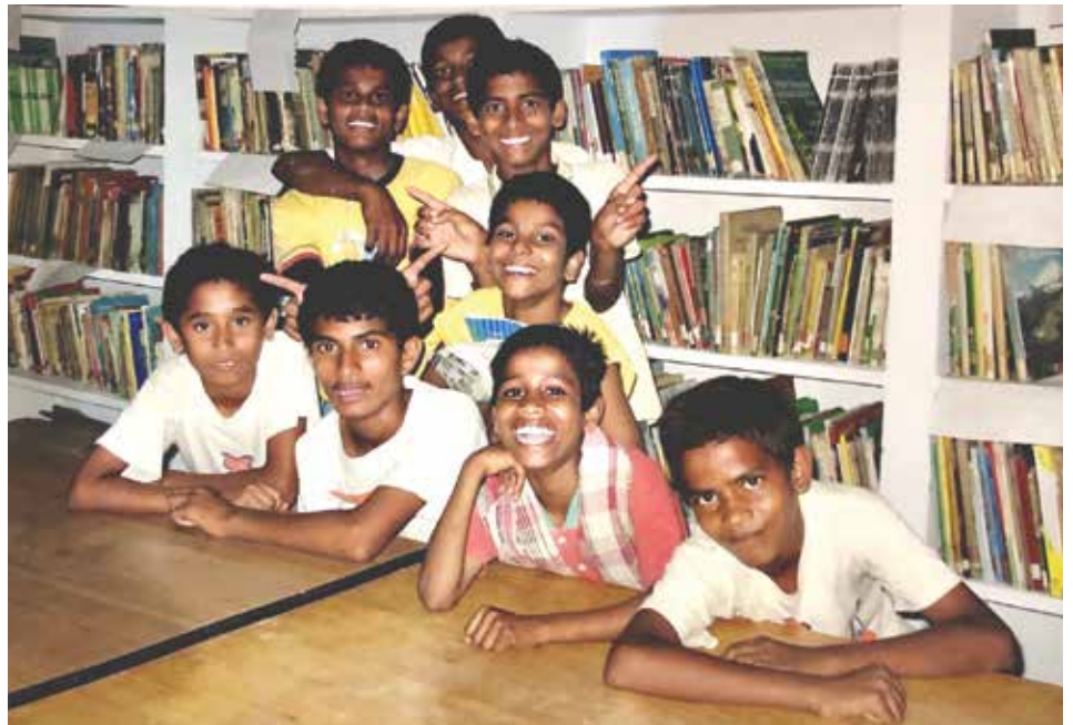
A job well done! HOINA boys pose with their completed library.

"After following the growth of HOINA for years, I saw a new need. In the year when HOINA's final move was to take place, I read in the news-