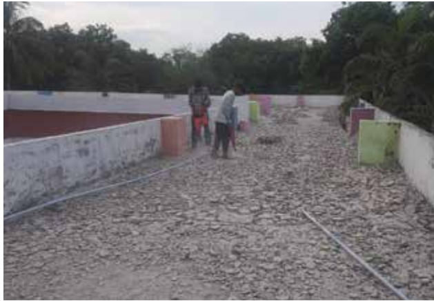
Workmen chipping concrete down to the mother slab.