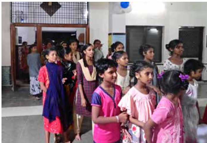
Happy girls entering their refurbished home for the first time in five months.