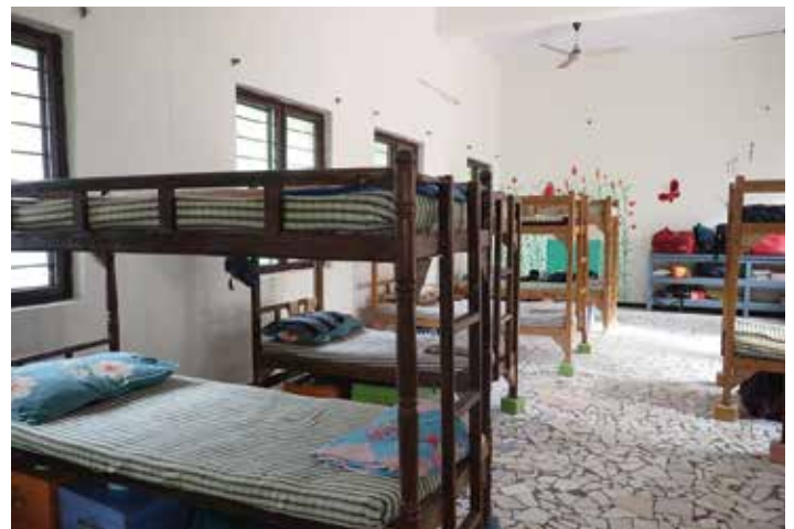
Fully repaired and painted girls' dormitory room with wall art in progress (in the background).

HOINA is a 501(c)3, tax-exempt organization.