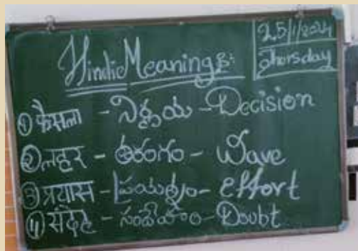
Hindi, Telegu, and English language lesson.

A major new item this year is the addition of securing sponsors within India (both individuals and businesses.) HOINA has a renewed focus on continuing the increase of local / rupee (INR) donations as the organization moves forward in alignment with the government's focus on higher local accountability.