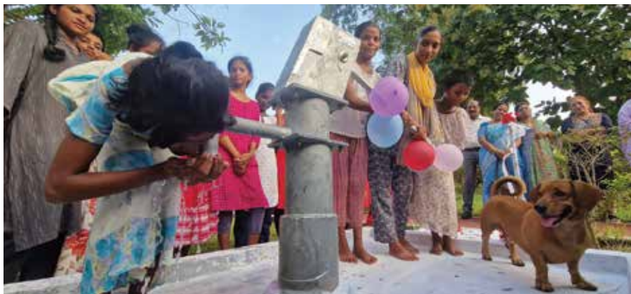
A drink of fresh water!

HOINA is a 501(c)3, tax-exempt organization.